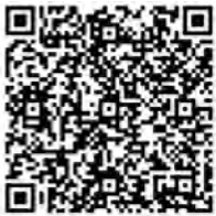
CAD & CAG

US Branch Yasui Seiki - MIRWEC Coating 601 S. Liberty Dr. Bloomington, IN 47403 (812) 331-7194 sales@yasuiseiki.com